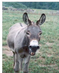
Oliver vs. Cactus

Respond by 6/28/2010 at www.turningpointedonkeyrescue.com