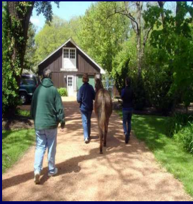
Genie being walked to her new life in Illinois.

“Though he doesn’t know much about leading, fly spray, or farriers, he does know people bring food, and that’s usually exactly what brings him over.”